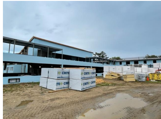
Roofing materials stored on site