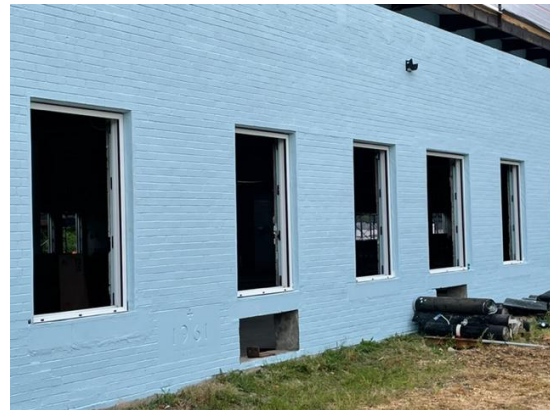
Installed window frames and applied waterproofing agent on East Wing