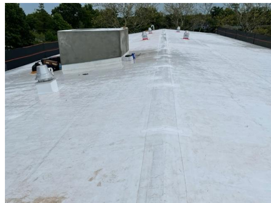
Installed roof on East Wing