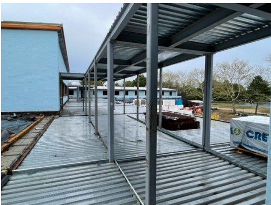
Steel and decking installed on second floor, between West and Central Wings