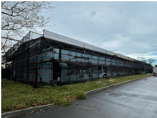
Stucco work in progress on East Wing