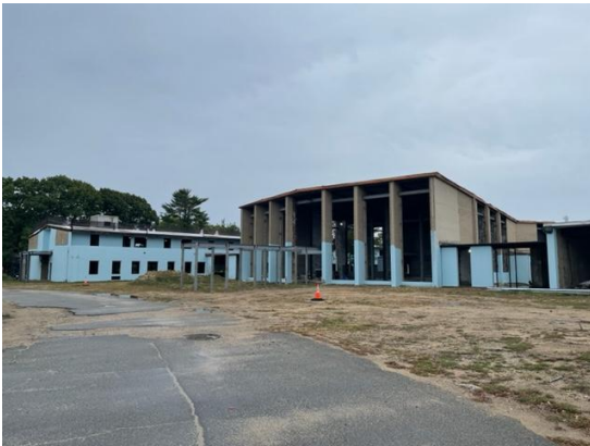
Blue waterproofing agent being applied to building exteriors, prior to stucco