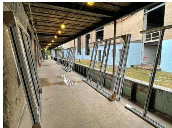
Window frames delivered for West Wing