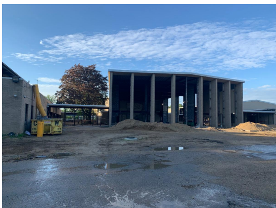
Views of demolished exteriors along main entrance, north facade.

So...the time is NOW for those of you who have not yet participated in the Capital Campaign. So many people in the community have been very enthusiastic in their support of the expansion and their desire to see its realization. Well, it is now time to transform those sentiments into substantive actions by checking out the remaining Naming Opportunities or reach out to our Development Office to discuss being a part of this project which will impact the lives of so many people. If you cannot make a major gift, then what you can donate will bring us one day closer to opening the new and expanded facility. A blessed and enjoyable summer to you and we look forward to hearing from you in the not too distant future!