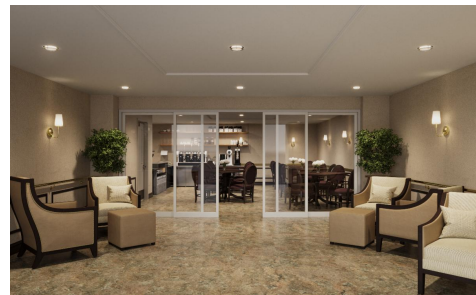
St. Michael's Coffee Lounge Rendering