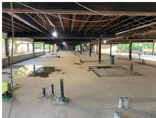
Installed underground plumbing and poured slab on east wing.