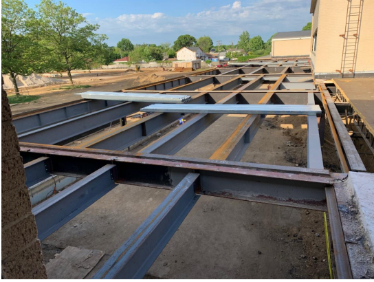
New steel erected along south side of the building; metal deck ready to be set.