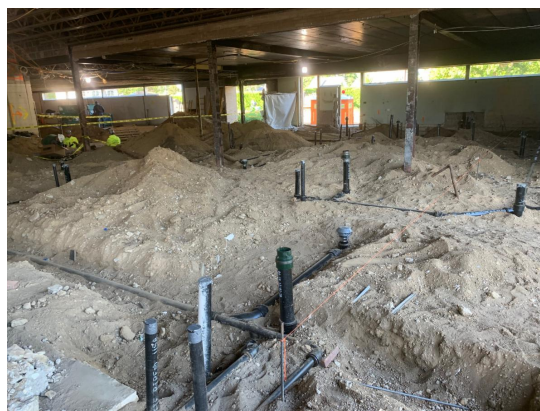
Installed underground plumbing for kitchen area.