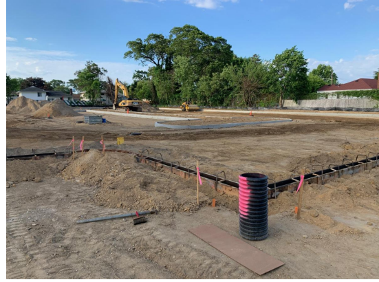
Poured curbs for southwest parking lot.