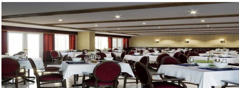
Kafeneion (Coffee Shop)