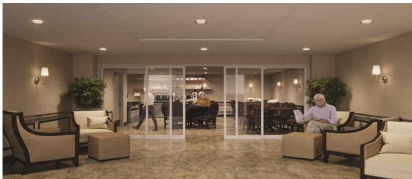
Main Entrance & Reception Desk