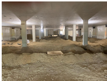
View of West Wing's first floor with underground plumbing in progress