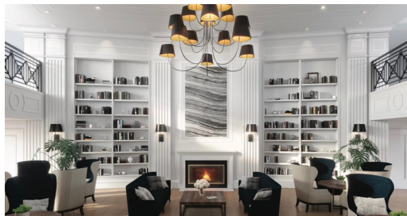
St. Michael's Community Room