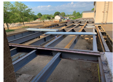
Steel and metal decking being erected at rear of Central Wing

Please help us continue the work by making a donation NOW .